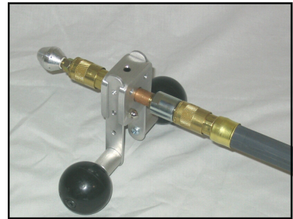
Reverse air nozzle