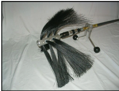
Clean: 8" to 22" ductwork