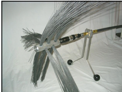
Clean: 20" to 30" ductwork