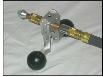
Forward air nozzle