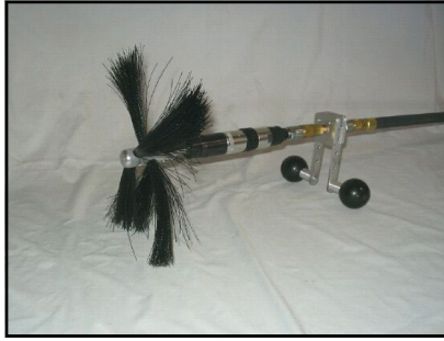
Clean: 4" to 10" ductwork