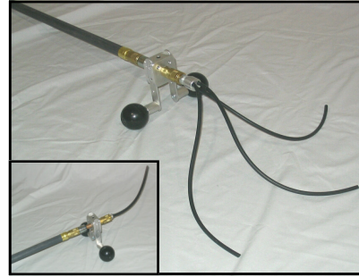
Tri & single whip